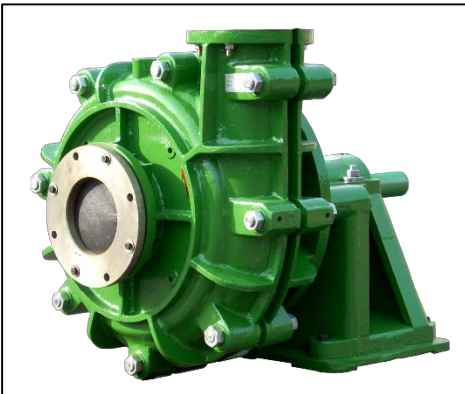
Schurco Slurry 10x8 high-chrome lined pump.

Since 1975 Schurco Slurry has been a driving force in the pumping industry. Originally founded to be a technically advanced repair and machine shop for critical pumping equipment in mills around the country, Schurco Slurry evolved by expanding our capabilities over time to the full-service slurry pump manufacturing company that our customers know today.