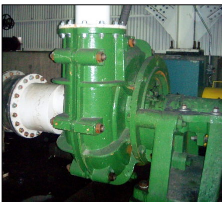
Dilute media pump in coal prep plant

We are grateful for the continued patronage of our customers in the coal industry. When times are tough, and many around the country have turned their backs on this vitally important industrial sector, we stand behind the producers of cost-effective, clean, and domestic coal. Please let us know how we can serve you.